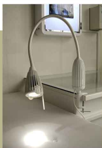
Reduced size powerful lighting