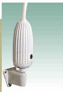
Electronic transformer integrated in the arm