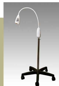
Rolling stand with 5 castors